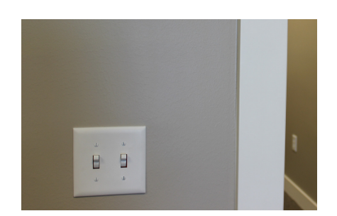
Choose your location