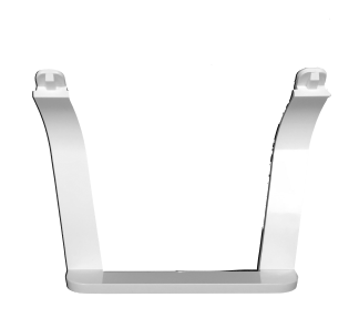
Optional Table Stand