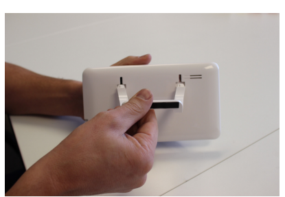
Connect table stand to upper holes on the back of the device and snap into place