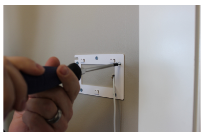
Secure wall mount to the wall with provided hardware