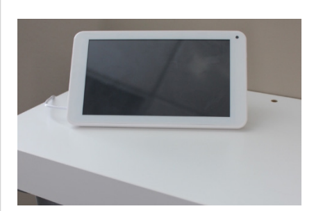
Choose your location