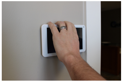
Slide IQ Remote onto wall mount bracket