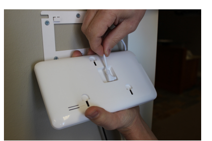
Connect power supply to the back