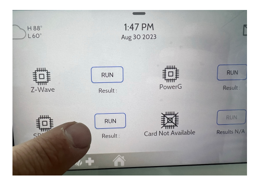
Run the "SRF" test. Allow up to 2 min for the panel to successfully test the radio in the new IQ Card. If test fails, reboot the panel and try again.

The IQ Panel will automatically recognize the newly-installed IQ Card-319 and it is now ready to use.