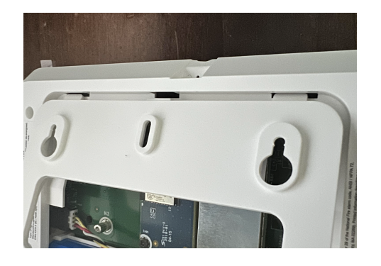
Replace the back cover, top tabs first.