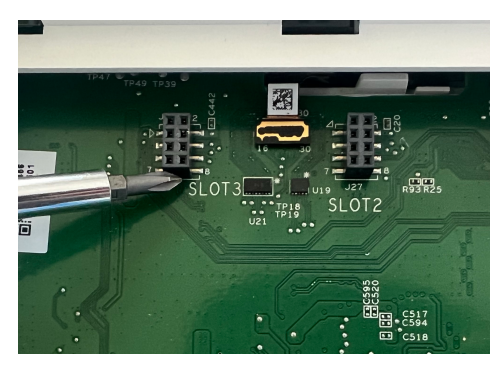
Locate "SLOT 3" which is designated as the slot for SRF daughter cards.

Once the screw has been loosened, pull the backplate away from the panel to remove.