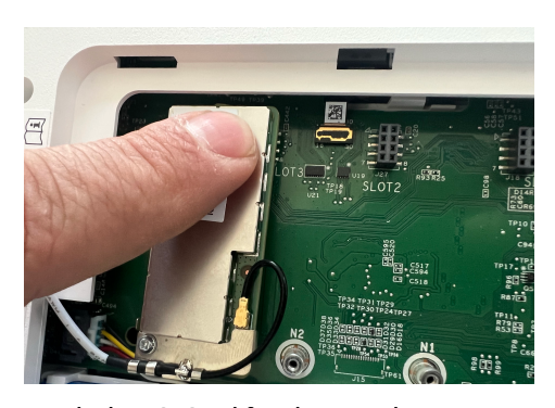
Push the IQ Card firmly into place.