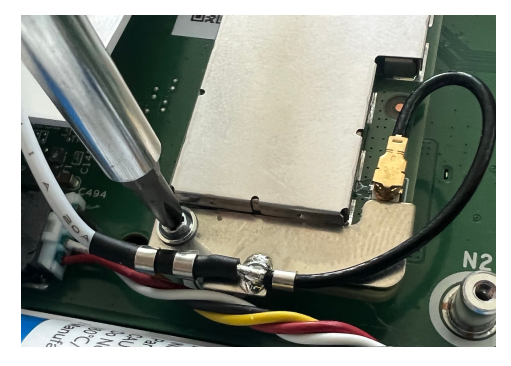
Install and tighten the provided locking screw to secure the IQ Card into place. Ensure the antenna remains connected and does not interfere with the battery.