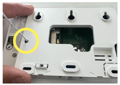
Ensure the white SRF antenna is routed out the hole in the backplate. Press down on the bottom and tighten the retaining screw.