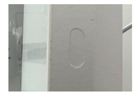
Plug the power supply back in and press and hold the power button for 3 sec to power on.