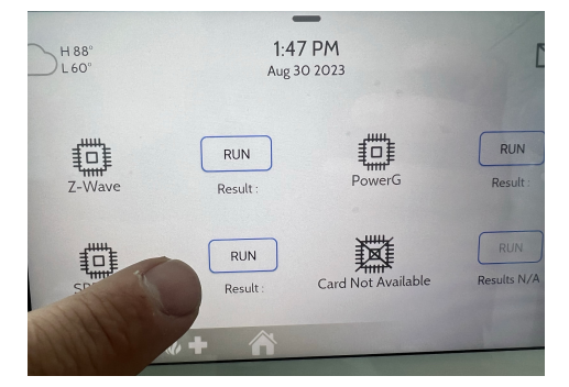
Run the "SRF" test. Allow up to 2 min for the panel to successfully test the radio in the new IQ Card. If test fails, reboot the panel and try again.

The IQ Panel will automatically recognize the newly-installed IQ Card-345 and it is now ready to use.