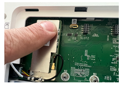
Push the IQ Card firmly into place.