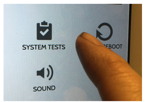
Swipe down and touch "Settings" then "Advanced Settings". Enter your code and touch "System Tests".