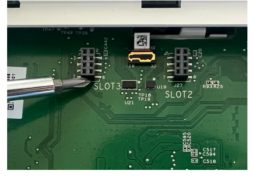
Locate "SLOT 3" which is designated as the slot for SRF daughter cards.

Once the screw has been loosened, pull the backplate away from the panel to remove.