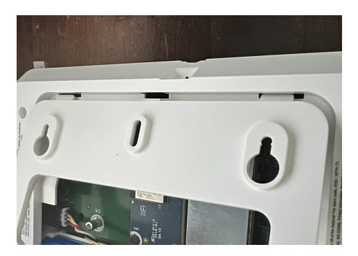
Replace the back cover, top tabs first.