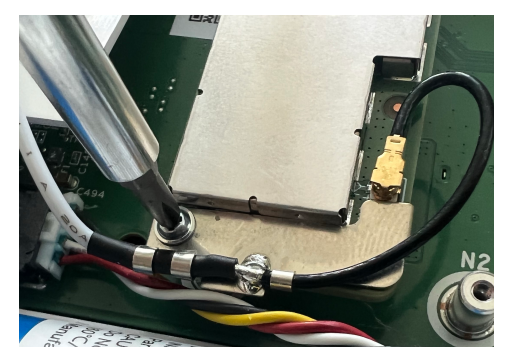
Install and tighten the provided locking screw to secure the IQ Card into place. Ensure the antenna remains connected and does not interfere with the battery.