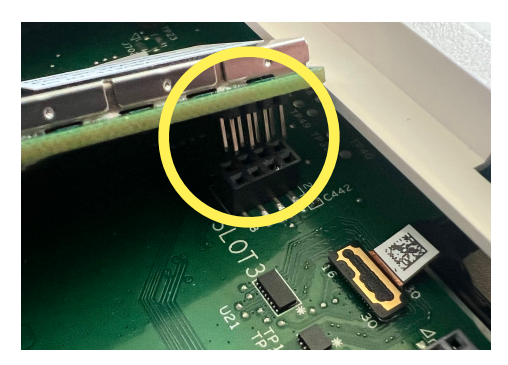
Match the pins on the bottom of the IQ Card to the terminal on the IQ Panel.