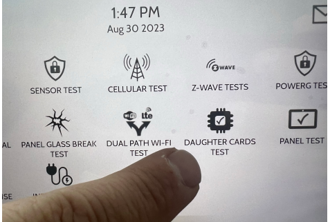
Touch "Daughter Cards Test".