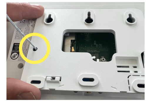
Ensure the white SRF antenna is routed out the hole in the backplate. Press down on the bottom and tighten the retaining screw.