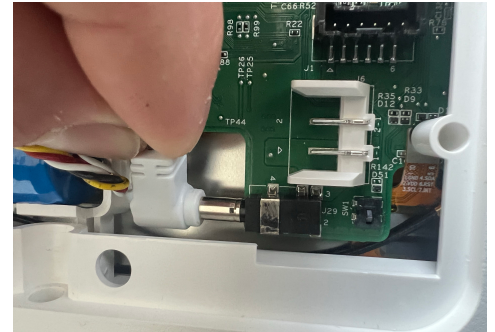
Once the IQ Panel has completely powered down, unplug or disconnect the power by removing the barrel jack connector inside the panel or by unplugging the power supply. NOTE: it is NOT required to disconnect the battery.

Swipe down and touch "Settings" then "Advanced Settings". Enter your code and touch "POWER DOWN".