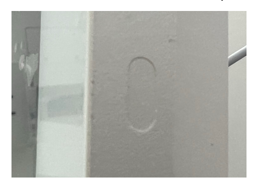
Plug the power supply back in and press and hold the power button for 3 sec to power on.