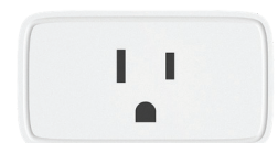
IQ Smart Plug SKU: IQIDP-PG