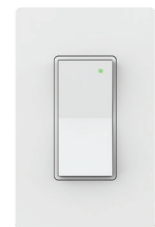
IQ Power Switch PG SKU: IQSWH-PG