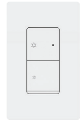
IQ Dimmer PG SKU: IQDMR-PG