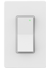
IQ Power Switch PG SKU: IQSWH-PG