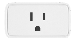
IQ Smart Plug SKU: IQIDP-PG